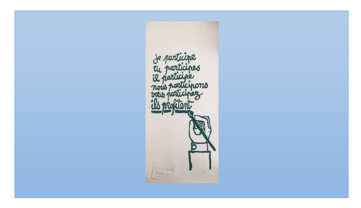
Figure 1. 'Je participe' poster (From https://www.akg-images.com/archive/I-participate--you-participate-...-they-profit-2UMDHU78VBLK.html).

profession when its response about 'engagement' is that the public must be 'educated' on the value of the profession. Why should the public care to be so 'educated'? The onus, surely, is on the profession to be responsive to society. That can only happen through active engagement of the profession in the community and the broad participation of the community in the development of their built environment, their 'habitat.'